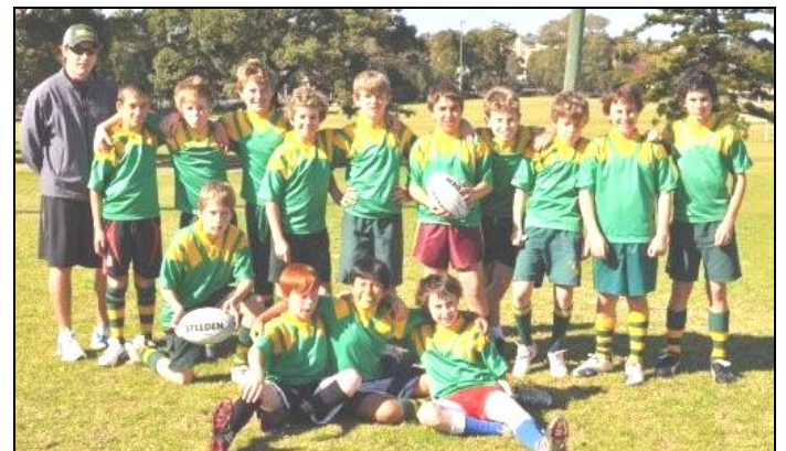
Oakville Public School Rugby Union Team 2009